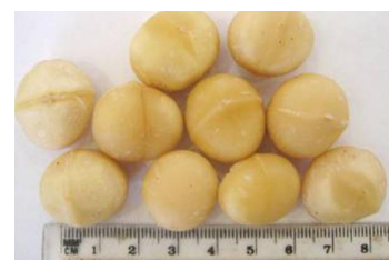
Fruit shape and size