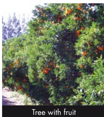
Tree with fruit