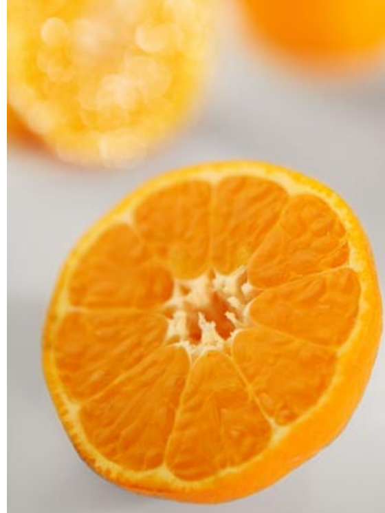
Valley Gold mandarin (B17)