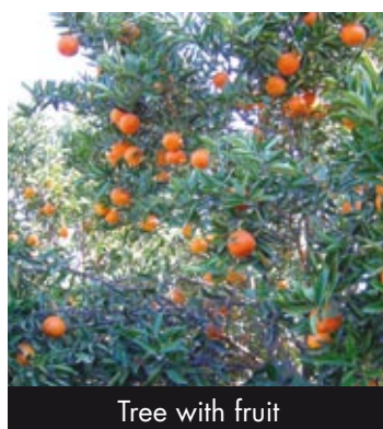
Tree with fruit